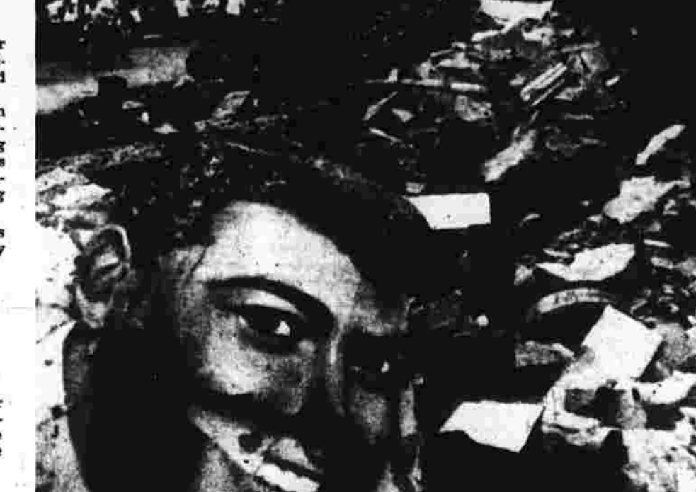
Poster of man sporting a neat crewcut, though 'cut and braided' from bullets and shrapnel...

WASHINGTON (AP) — A Senate Judiciary subcommittee approved today the bill urging President Johnson to ban mail order sales of shotguns and rifles.